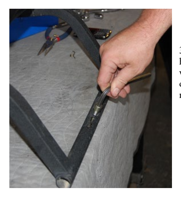
3. Remove the socket head bolt with an Allen wrench and reinstall onto your new PRP Seat mount.